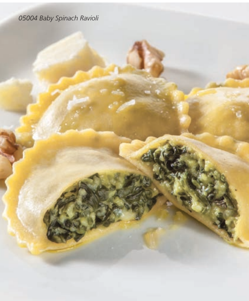
05004 Baby Spinach Ravioli