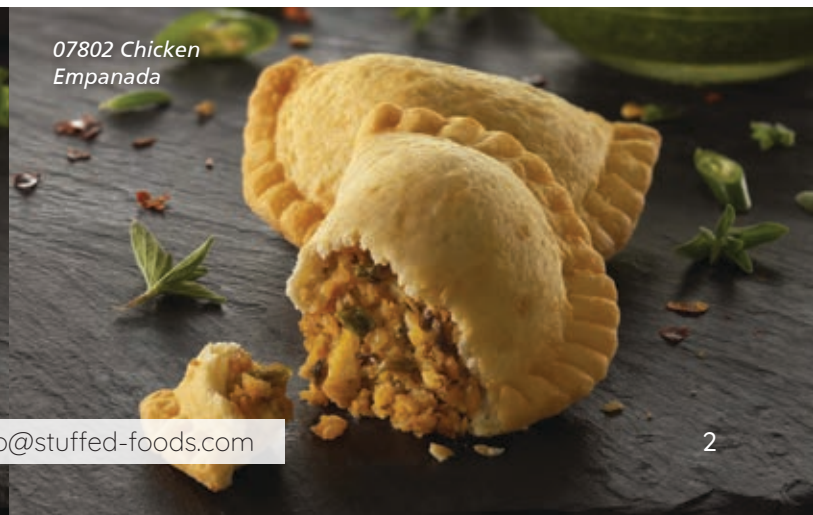
07802 Chicken Empanada