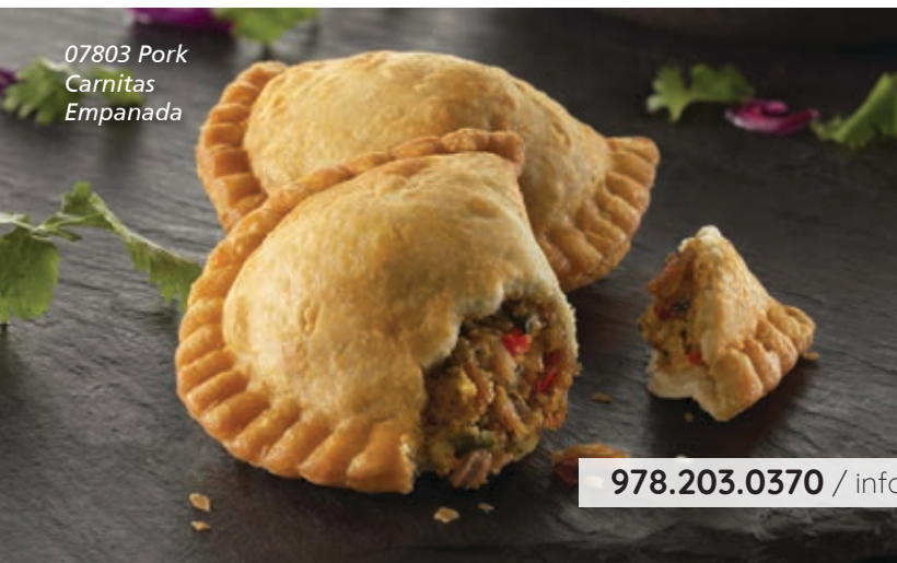
07803 Pork Carnitas Empanada